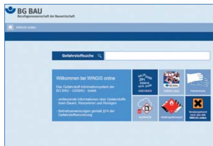
BG BAU's hazardous substances information system

This makes it easier for contract cleaners to comply with their statutory obligations arising from the German Ordinance on Hazardous Substances.